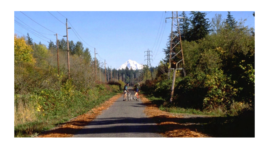
Wed. Dec. 4, from 9a ~~ NEW EVENT!!! UpRiver Walking Group

Sat. Nov. 23, from 4-8:00pm ~~ <u>Craft Warehouse</u> Make & Take Class - Make a Holiday Branch Centerpiece. <u>Read more and/or RSVP.</u>